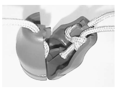
Additional Cord with knot placed over half hole, ready to be closed.